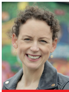
Senator Marie Sherlock