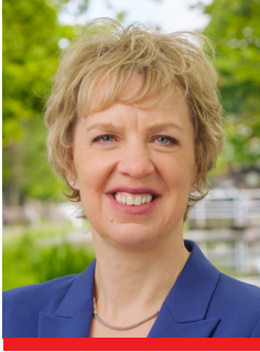
Ivana Bacik TD

Ivana Bacik TD is the Leader of the Labour Party and TD for Dublin Bay South. She was first elected as a Senator on the Dublin University panel in 2007, and was re-elected at each subsequent Seanad election before being elected to the Dáil in July 2021. A lifelong feminist, Ivana has a long track record of campaigning on feminist and human rights issues. In 2018 she was Chairperson of the Oireachtas Vótáil100 Programme, the series of events run to celebrate the centenary of women's suffrage in Ireland. She was also Chairperson of the Special Oireachtas Committee on Gender Equality, which was charged with considering the recommendations in the Report of the Citizens' Assembly on Gender Equality. For many years, Ivana was the Reid Professor of Criminal Law, Criminology and Penology at Trinity College Dublin, and has published extensively on criminal law, criminology, human rights, constitutional law and related matters.